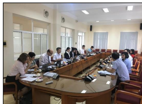
Viet Nam HiT kickoff meeting, October 2019